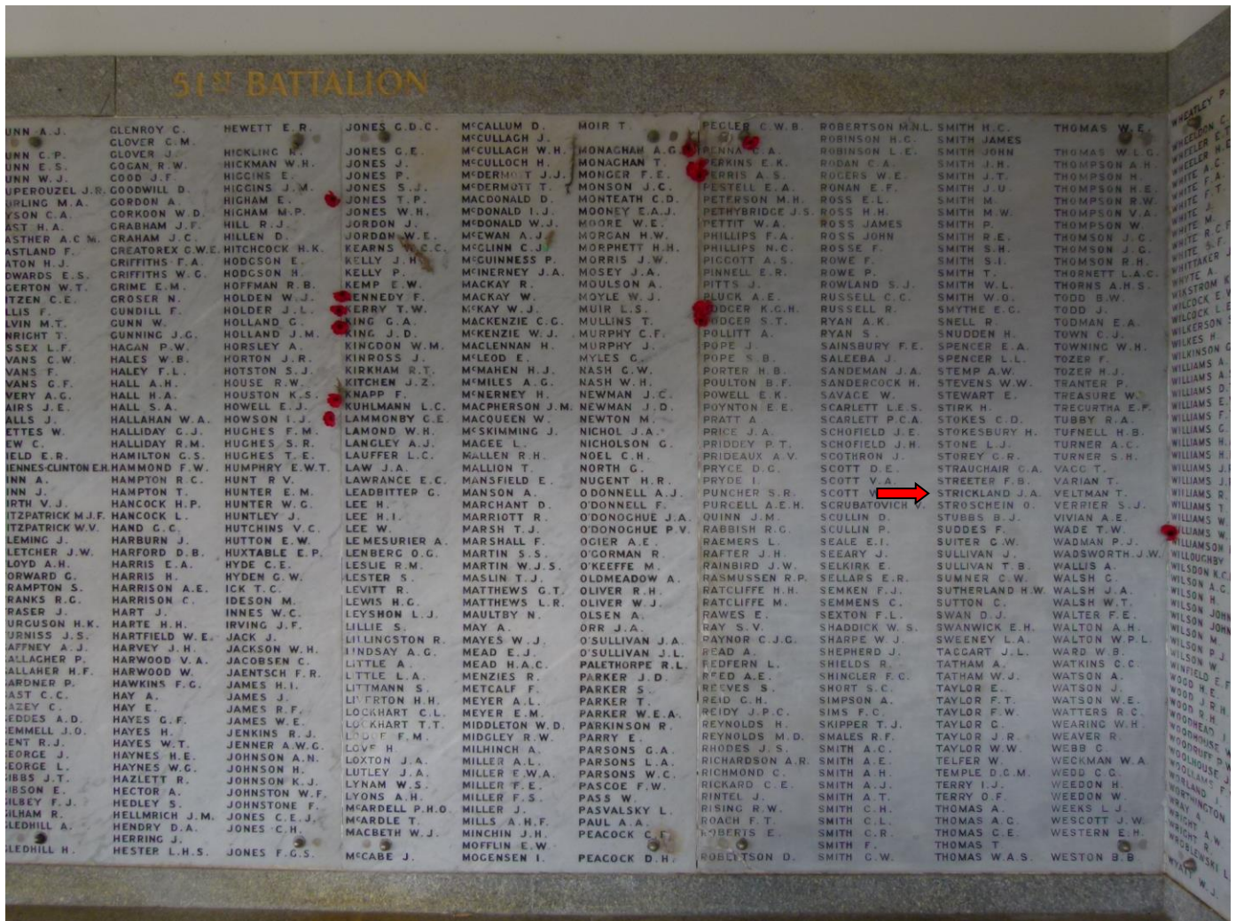
51st Battalion Panel