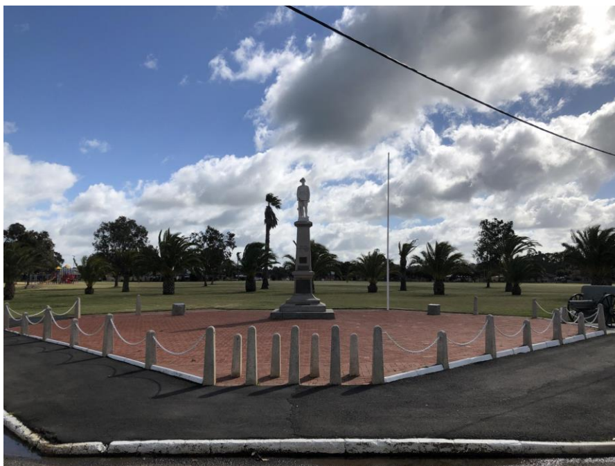
Katanning War Memorial