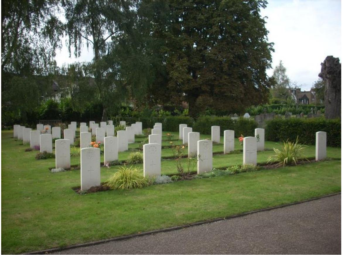
War Graves in Hatfield Road Cemetery, St. Albans