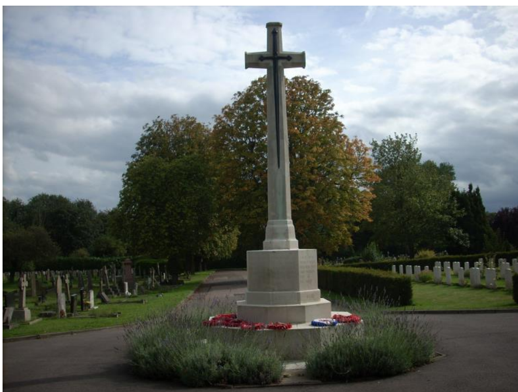
Cross of Sacrifice