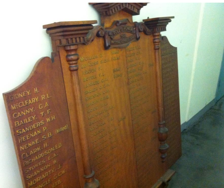
Western Australia Bank First World War Roll of Honour