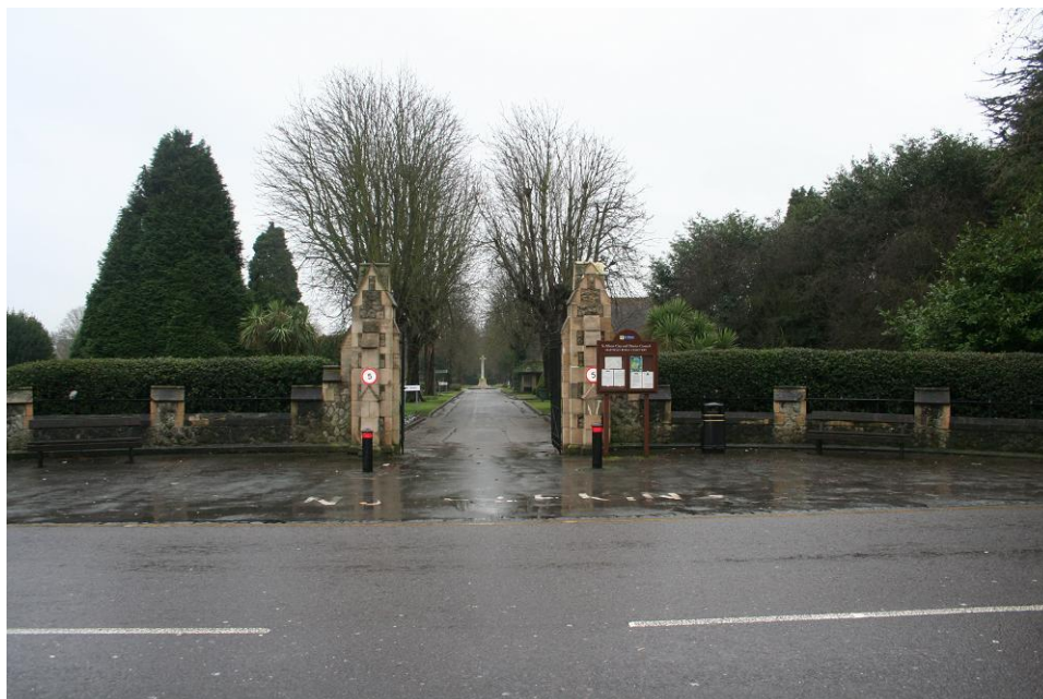
Entrance to Hatfield Road Cemetery, St. Albans